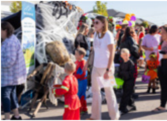
Castleview Hospital hosted our annual Trunk or Treat events alongside WorkPoint.