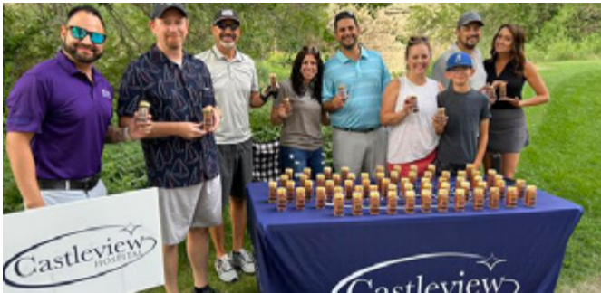
Castleview Hospital team members participated in the annual International Days Golf Tournament by handing out custom-created Castleview BBQ Rub.