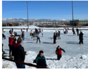
Castleview Hospital hosted the annual community ice skating day.